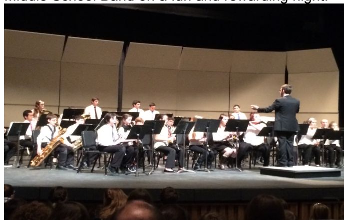
EMS Band members perform at the University of New Hampshire Youth Band Concert!

On April 6 th , the Epping Middle School Band performed at the University of New Hampshire as part of the NH Youth Band Concert. The EMS band was invited to open for the NH Youth Band, which is an ensemble comprised of middle and high school students from across New Hampshire. Our kids had an amazing performance and were able to watch quality music and have fun at a reception following the concert. Congratulations to the Epping Middle School Band on a fun and rewarding night!