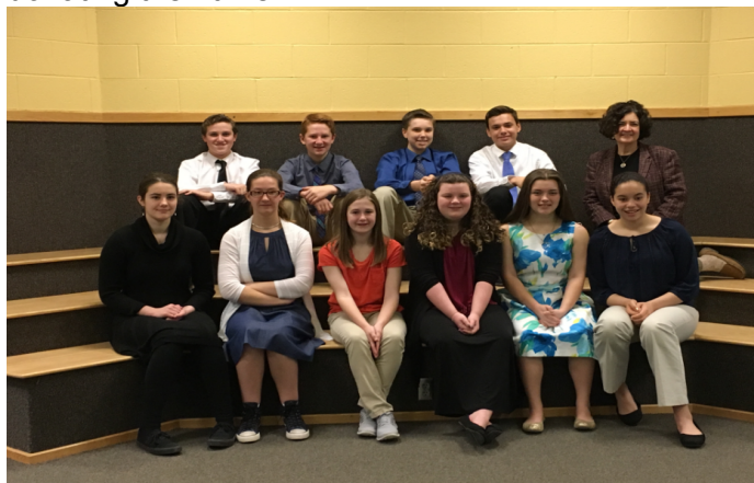
EMS Students head to Concord, NH to participate in the Youth in Government program