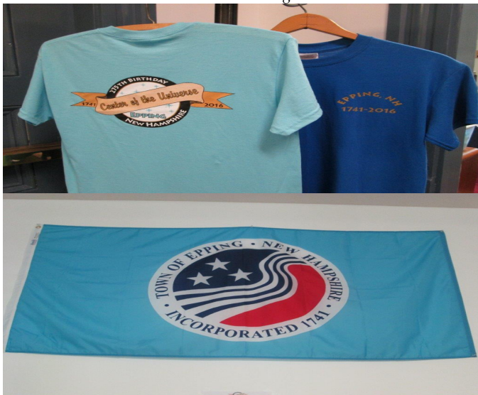
Submitted by Cliff Cray